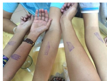
Visiting Political prisoners

Through SEAP 2018, the participants were able to meet people with different nationalities from different walks of life, acquire a broader perspective on the world, learn about feminism and the feminist theology, and have working knowledge on the inequalities pertaining to Gender and Sexuality and better understanding of mass media and how it can be harnessed to create positive impact on social issues such as gender inequality.