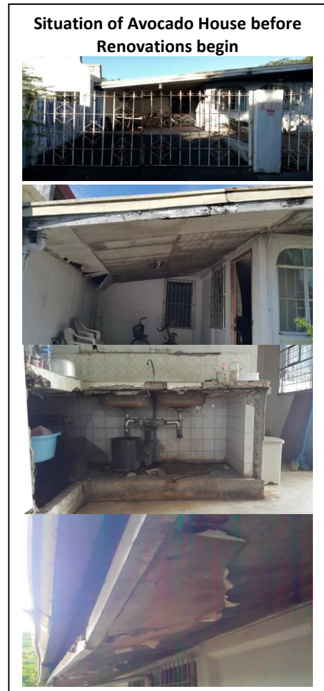
Situation of Avocado House before Renovations begin

advised by the engineers to consider demolition and rebuilding. However, taking into consideration the appalling financial condition of the Regional Coordination and refusal of support by the funders, the regional coordination has started with minimum renovation as an immediate solution as the outer structure could withstand for few years until we find resources to rebuild. The former members, national member movements, collaborators and well-wishers of IMCS Asia Pacific are supporting the renovations.