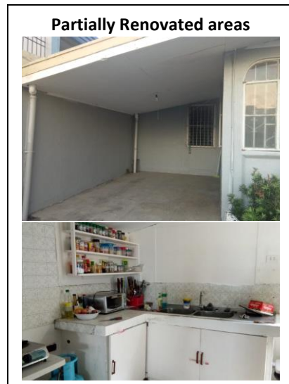
Partially Renovated areas

In 1995, the International Movement of Catholic Students (IMCS) Asia Pacific moved its Regional Secretariat to “Avocado House” which is located in 20, Avocado Road, Pilar Village, Las Pinas City, Metro Manila, Philippines. For more than two decades, “Avocado House” has been an Identity and Resource Centre to the movement Locally and Internationally. It has sheltered the Asia Pacific coordinators, Regional Chaplains, National Movement representatives (Student Leaders/Chaplains), Local Student leaders, Likeminded movements, visitors from Funding Agencies, Refugee Students from various countries in Asia Pacific region. Unfortunately, due to the change in the programmatic and structural focus of the funding agencies, the funding assistance that the IMCS Asia Pacific received over the years has declined. This halted timely physical maintenance (adequate repairs and renovation) of the house. Now, the Avocado House is close to 43 years old and is in very unhealthy condition. We have been