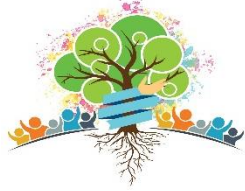
CAFE 2018 Logo

Chaplains and Animators Formation and Exchange 2018 (CAFE 2018) was held from 12th to 18th September 2018 in the Camillian Pastoral Center, Bangkok, Thailand. The 7-day long programme was conducted under the theme “Mission of Accompaniment - Accompanying Asia Pacific Students’ Prophetic Action” with the participation of 23 chaplains, animators and pastoral workers from 11 countries. Catholic Students Network of Thailand (CSNT), national IMCS member of Thailand, hosted the programme.