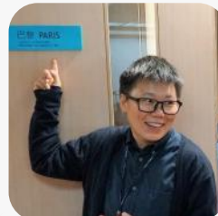
Law Lap Man Lay Female Chaplain Hong Kong / East Asia